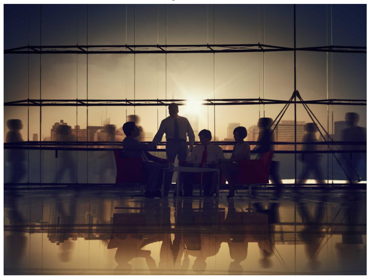
Frequently Asked Questions

1. I want to learn more about the International Association of Potential, New and Sitting Members of the Board of Directors (IAMBD).